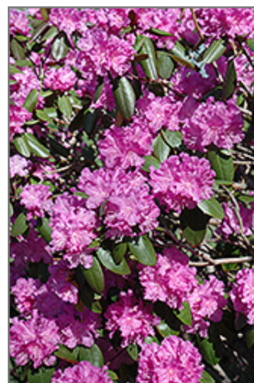
P.J.M. Rhododendron flowers