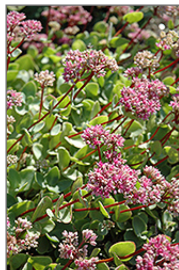
October Daphne flowers