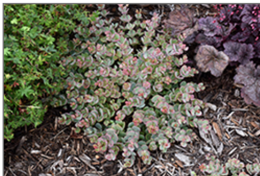
October Daphne