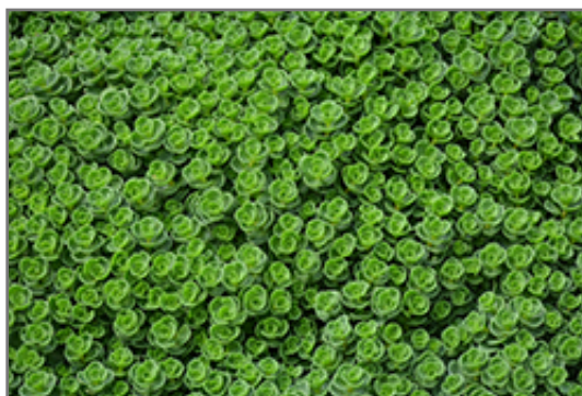
John Creech Stonecrop foliage