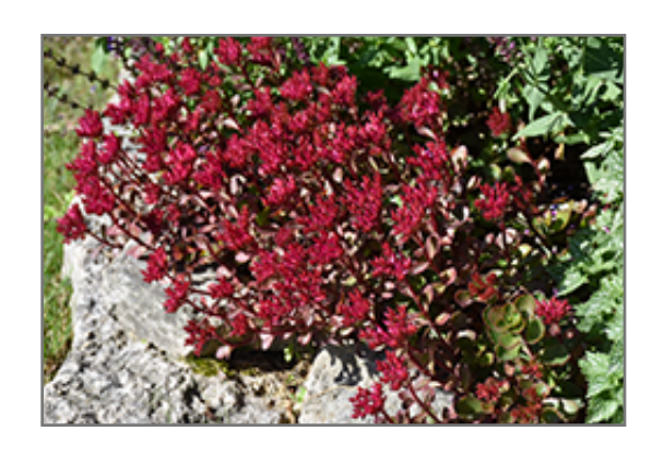
Voodoo Stonecrop in bloom