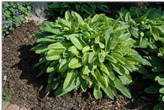
Hummelo Betony