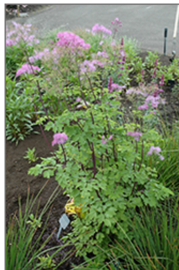
Black Stockings Meadow Rue in bloom