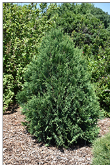
Technito Arborvitae