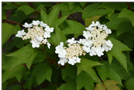
Redwing Highbush Cranberry flowers

Redwing Highbush Cranberry is a dense multi-stemmed deciduous shrub with an upright spreading habit of growth. Its average texture blends into the landscape, but can be balanced by one or two finer or coarser trees or shrubs for an effective composition.