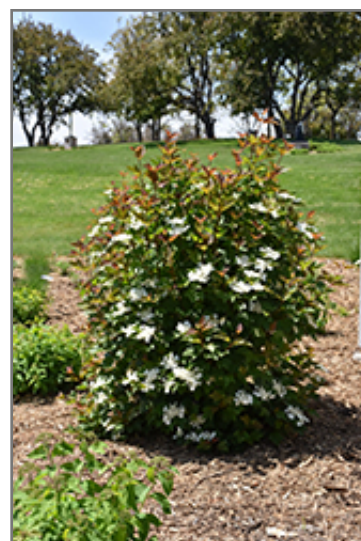
Redwing Highbush Cranberry in bloom