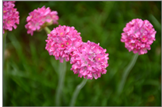
Bloodstone Sea Thrift flowers

Bloodstone Sea Thrift is a fine choice for the garden, but it is also a good selection for planting in outdoor pots and containers. It is often used as a 'filler' in the 'spiller-thriller-filler' container combination, providing a mass of flowers against which the thriller plants stand out. Note that when growing plants in outdoor containers and baskets, they may require more frequent waterings than they would in the yard or garden. Be aware that in our climate, most plants cannot be expected to survive the winter if left in containers outdoors, and this plant is no exception. Contact our experts for more information on how to protect it over the winter months.