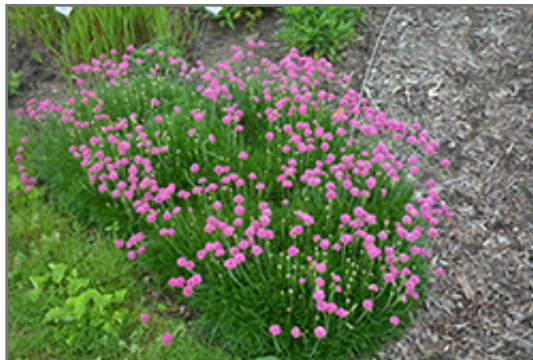
Bloodstone Sea Thrift in bloom