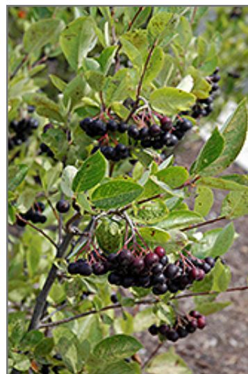
Iroquois Beauty Black Chokeberry fruit