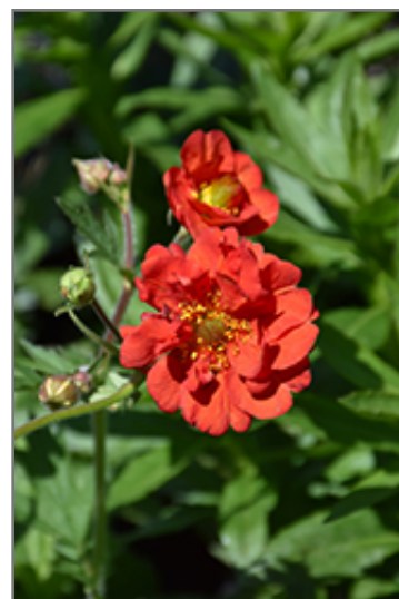
Blazing Sunset Avens flowers