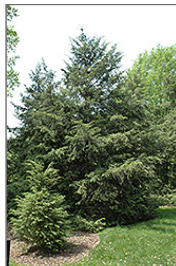
Canadian Hemlock