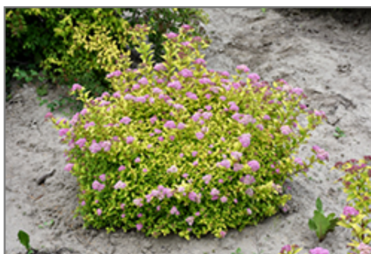
Sundrop Spirea in bloom