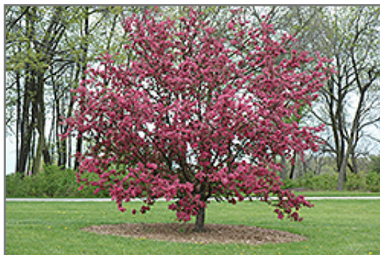
Purple Prince Flowering Crab in bloom