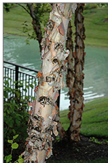
River Birch bark

River Birch will grow to be about 60 feet tall at maturity, with a spread of 45 feet. It has a low canopy with a typical clearance of 3 feet from the ground, and should not be planted underneath power lines. It grows at a fast rate, and under ideal conditions can be expected to live for 70 years or more.