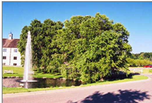
River Birch