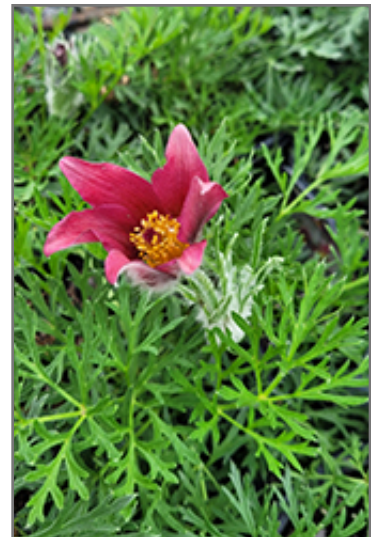
Red Pasqueflower flowers