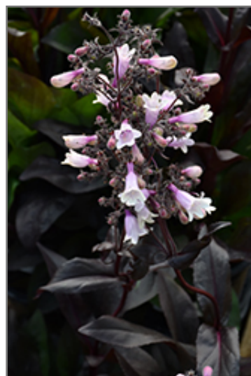
Dark Towers Beard Tongue flowers