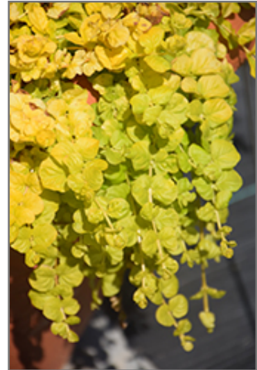
Goldilocks Creeping Jenny foliage

Goldilocks Creeping Jenny is recommended for the following landscape applications;