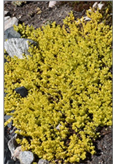
Goldilocks Creeping Jenny

Goldilocks Creeping Jenny is a fine choice for the garden, but it is also a good selection for planting in outdoor containers and hanging baskets. Because of its spreading habit of growth, it is ideally suited for use as a 'spiller' in the 'spiller-thriller-filler' container combination; plant it near the edges where it can spill gracefully over the pot. Note that when growing plants in outdoor containers and baskets, they may require more frequent waterings than they would in the yard or garden. Be aware that in our climate, most plants cannot be expected to survive the winter if left in containers outdoors, and this plant is no exception. Contact our experts for more information on how to protect it over the winter months.