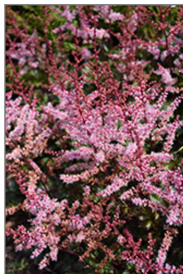
Delft Lace Astilbe flowers

Delft Lace Astilbe is recommended for the following landscape applications;