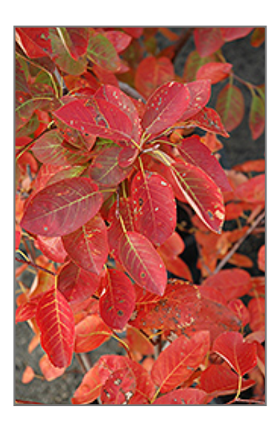
Autumn Brilliance Serviceberry in fall