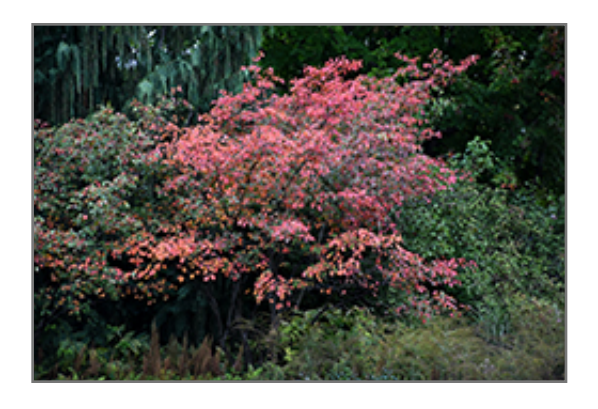
Autumn Brilliance Serviceberry in fall

This tree does best in full sun to partial shade. It prefers to grow in average to moist conditions, and shouldn't be allowed to dry out. It is not particular as to soil type or pH. It is somewhat tolerant of urban pollution. This particular variety is an interspecific hybrid.