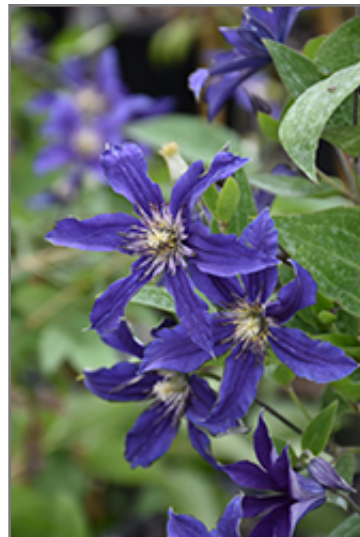
Sapphire Indigo Clematis flowers