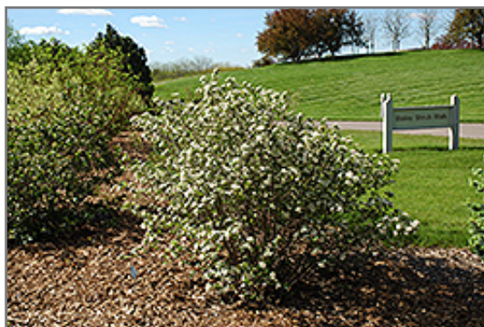
Autumn Magic Black Chokeberry in bloom