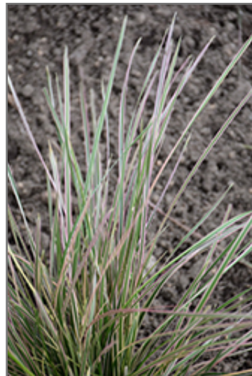
Northern Lights Tufted Hair Grass foliage