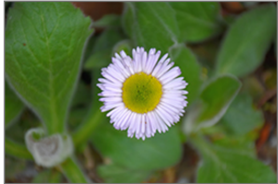
Lynnhaven Carpet Fleabane flowers

Lynnhaven Carpet Fleabane will grow to be about 7 inches tall at maturity extending to 15 inches tall with the flowers, with a spread of 15 inches. Its foliage tends to remain low and dense right to the ground. The flower stalks can be weak and so it may require staking in exposed sites or excessively rich soils. It grows at a fast rate, and under ideal conditions can be expected to live for approximately 10 years. As an herbaceous perennial, this plant will usually die back to the crown each winter, and will regrow from the base each spring. Be careful not to disturb the crown in late winter when it may not be readily seen!