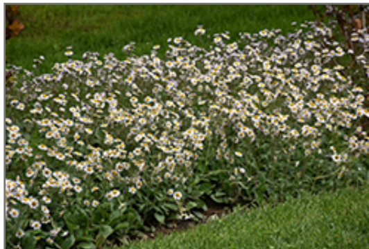
Lynnhaven Carpet Fleabane in bloom