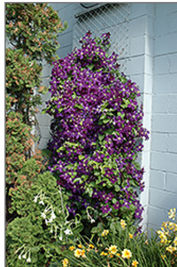
Jackmanii Superba Clematis in bloom