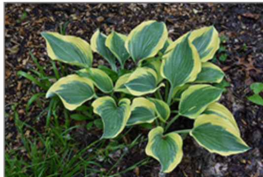
Liberty Hosta