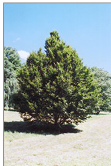
American Hornbeam