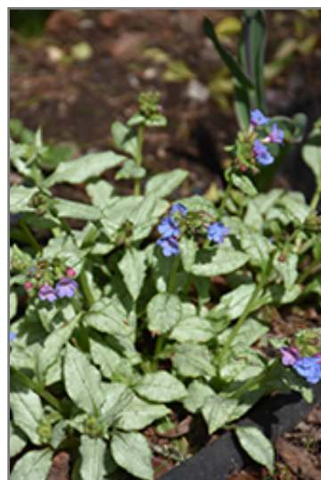
Moonshine Lungwort in bloom

Moonshine Lungwort is recommended for the following landscape applications;