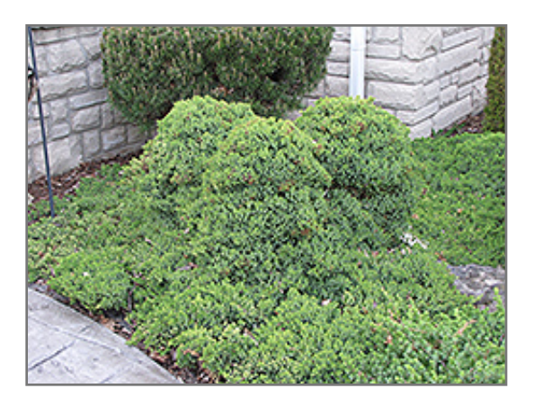
Dwarf Japanese Garden Juniper

3352 N Service Dr. Red Wing, MN, 55066 phone: 651-388-3847 www.sargentsnursery.com