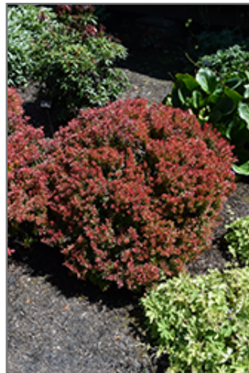
Golden Ruby Barberry