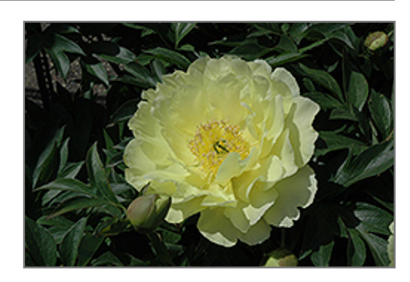
Yumi Peony flowers