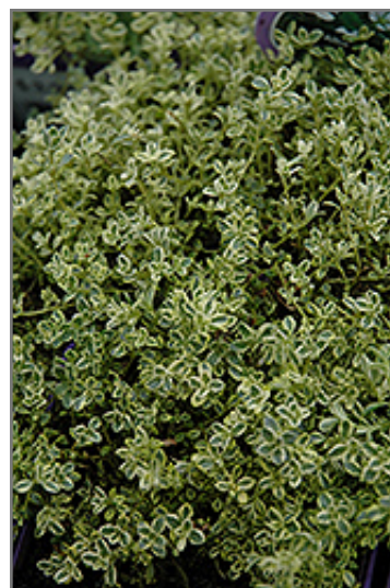
Highland Cream Creeping Thyme

Highland Cream Creeping Thyme is recommended for the following landscape applications;