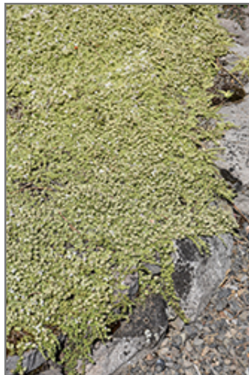
Highland Cream Creeping Thyme