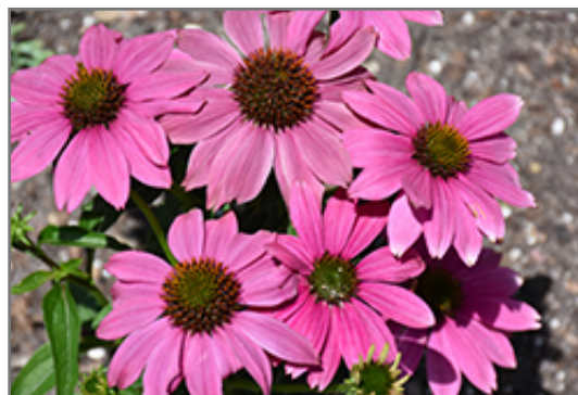
PowWow Wild Berry Coneflower flowers