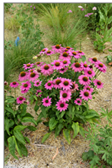
PowWow Wild Berry Coneflower in bloom

PowWow Wild Berry Coneflower is recommended for the following landscape applications;