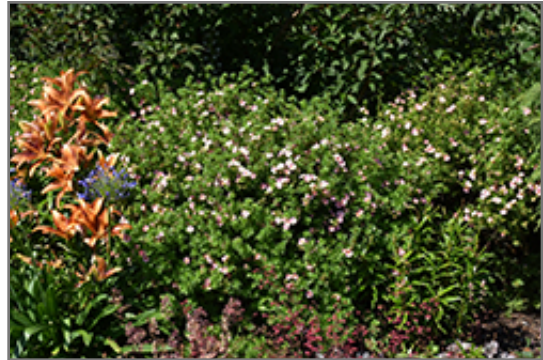
Pink Beauty Potentilla in bloom

This shrub does best in full sun to partial shade. It is very adaptable to both dry and moist locations, and should do just fine under typical garden conditions. It is considered to be drought-tolerant, and thus makes an ideal choice for a low-water garden or xeriscape application. It is not particular as to soil type or pH. It is highly tolerant of urban pollution and will even thrive in inner city environments. This is a selection of a native North American species.