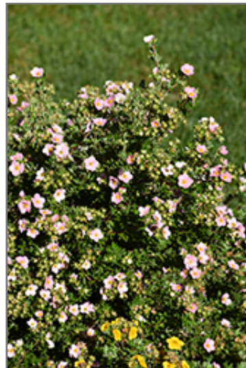
Pink Beauty Potentilla flowers