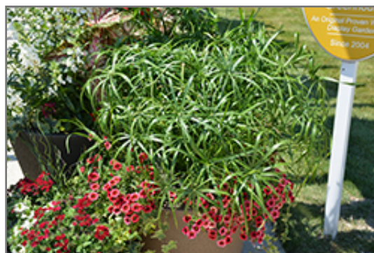
Baby Tut Umbrella Grass