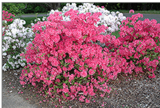
Rosy Lights Azalea in bloom