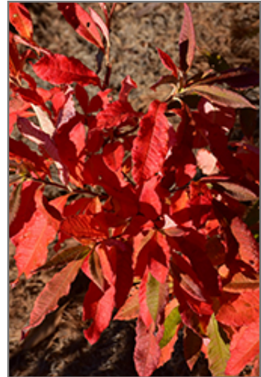
Rosy Lights Azalea in fall

This shrub does best in full sun to partial shade. You may want to keep it away from hot, dry locations that receive direct afternoon sun or which get reflected sunlight, such as against the south side of a white wall. It requires an evenly moist well-drained soil for optimal growth, but will die in standing water. It is very fussy about its soil conditions and must have rich, acidic soils to ensure success, and is subject to chlorosis (yellowing) of the foliage in alkaline soils. It is somewhat tolerant of urban pollution, and will benefit from being planted in a relatively sheltered location. Consider applying a thick mulch around the root zone in winter to protect it in exposed locations or colder microclimates. This particular variety is an interspecific hybrid.