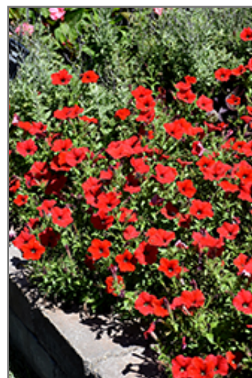
Easy Wave Red Petunia flowers