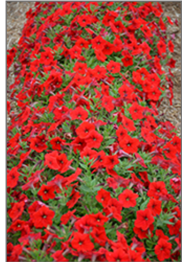
Easy Wave Red Petunia in bloom

Easy Wave Red Petunia is a fine choice for the garden, but it is also a good selection for planting in outdoor containers and hanging baskets. Because of its trailing habit of growth, it is ideally suited for use as a 'spiller' in the 'spiller-thriller-filler' container combination; plant it near the edges where it can spill gracefully over the pot. Note that when growing plants in outdoor containers and baskets, they may require more frequent waterings than they would in the yard or garden.