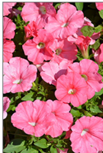
Supertunia Bermuda Beach Petunia flowers