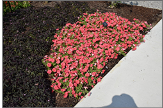
Supertunia Bermuda Beach Petunia in bloom

Supertunia Bermuda Beach Petunia is a fine choice for the garden, but it is also a good selection for planting in outdoor containers and hanging baskets. Because of its trailing habit of growth, it is ideally suited for use as a 'spiller' in the 'spiller-thriller-filler' container combination; plant it near the edges where it can spill gracefully over the pot. Note that when growing plants in outdoor containers and baskets, they may require more frequent waterings than they would in the yard or garden.