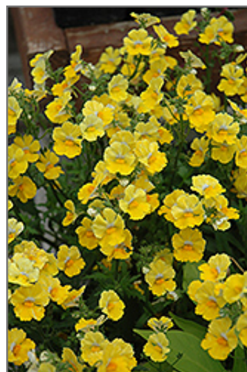
Sunsatia Lemon Nemesia flowers

Sunsatia Lemon Nemesia will grow to be about 10 inches tall at maturity, with a spread of 18 inches. When grown in masses or used as a bedding plant, individual plants should be spaced approximately 12 inches apart. Its foliage tends to remain low and dense right to the ground. This fast-growing annual will normally live for one full growing season, needing replacement the following year.