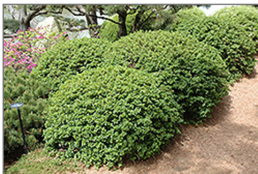
Green Mound Alpine Currant