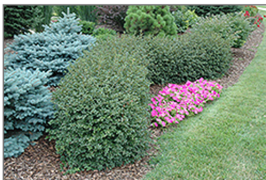
Green Mound Alpine Currant