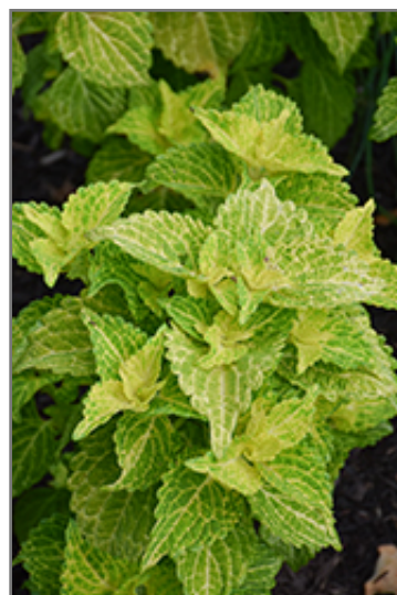
Electric Lime Coleus foliage