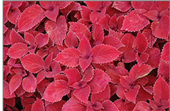
Redhead Coleus foliage

Redhead Coleus will grow to be about 24 inches tall at maturity, with a spread of 28 inches. When grown in masses or used as a bedding plant, individual plants should be spaced approximately 22 inches apart. Although it's not a true annual, this fast-growing plant can be expected to behave as an annual in our climate if left outdoors over the winter, usually needing replacement the following year. As such, gardeners should take into consideration that it will perform differently than it would in its native habitat.