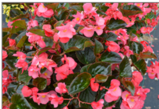
Big Rose Bronze Leaf Begonia flowers