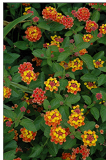
Landmark Citrus Lantana flowers