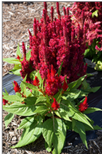
Fresh Look Red Celosia in bloom