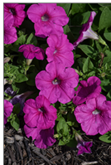
Easy Wave Neon Rose Petunia flowers