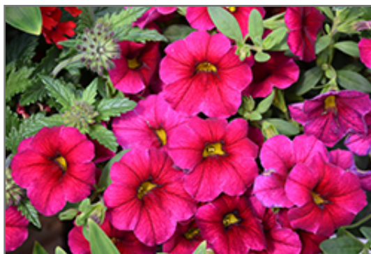
Superbells Cherry Red Calibrachoa flowers