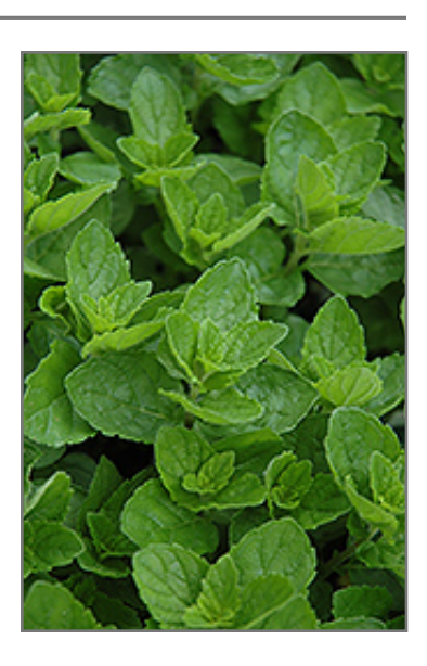
Spearmint foliage

Aside from its primary use as an edible, Spearmint is sutiable for the following landscape applications;