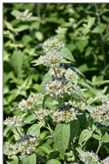
Short Toothed Mountain Mint flowers

Short Toothed Mountain Mint is recommended for the following landscape applications;