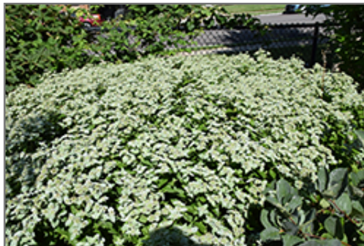
Short Toothed Mountain Mint in bloom