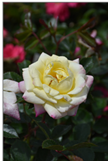
Music Box Rose flowers